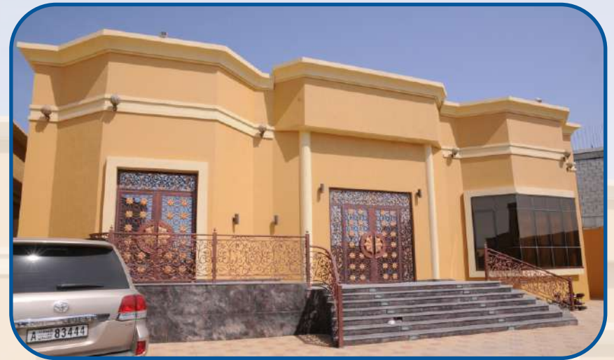
Ground Only Residential Villa Al Jurf, Ajman - UAE.