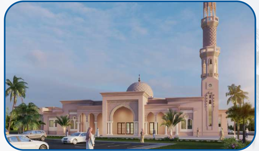
Mosque + G+1 Res. Block + Guard Block Al Quoz Fourth, Dubai - UAE.