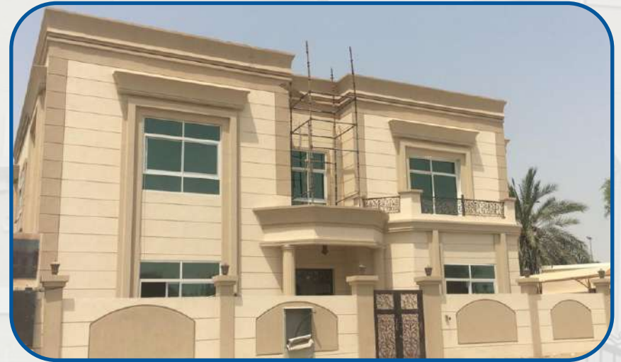
G+1 Residential Villa Al Rashidiya, Dubai - UAE.