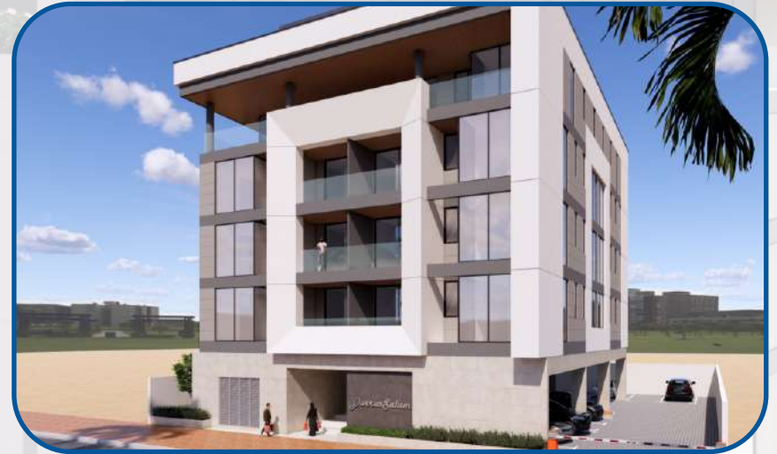
Ground + 4 Building Liwan - 2, Dubai - UAE.