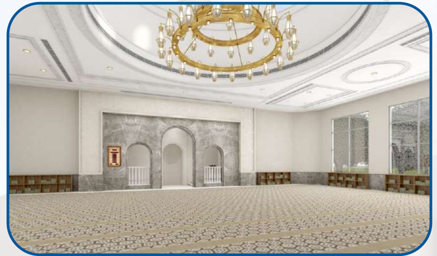
Mosque + Service Block International City, Dubai - UAE.