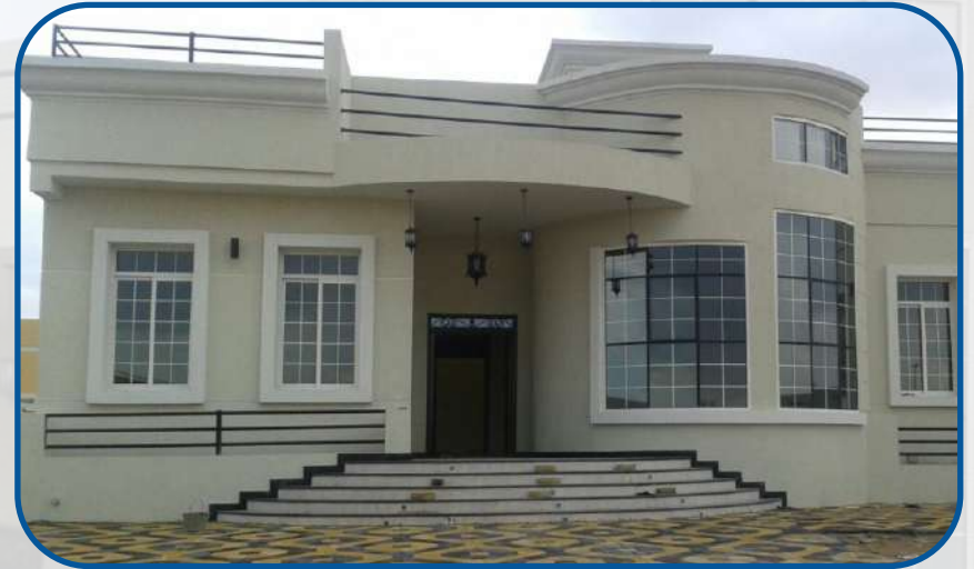
Ground Only Residential Villa Al Barsha South 2, Dubai - UAE.