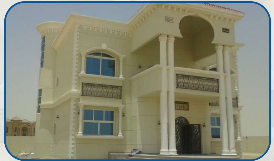
G+1 Residential Villa Al Seyouh 1, Sharjah - UAE.