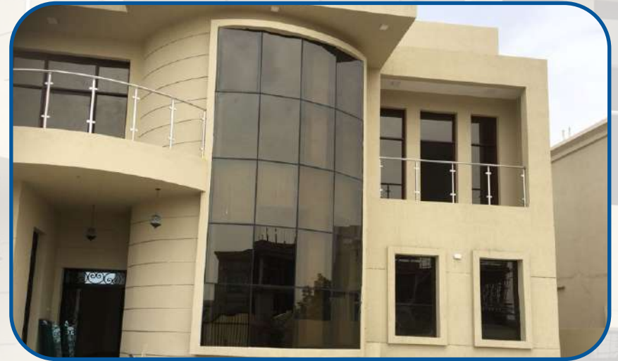
G+1 Residential Villa Al Barsha South 2, Dubai - UAE.