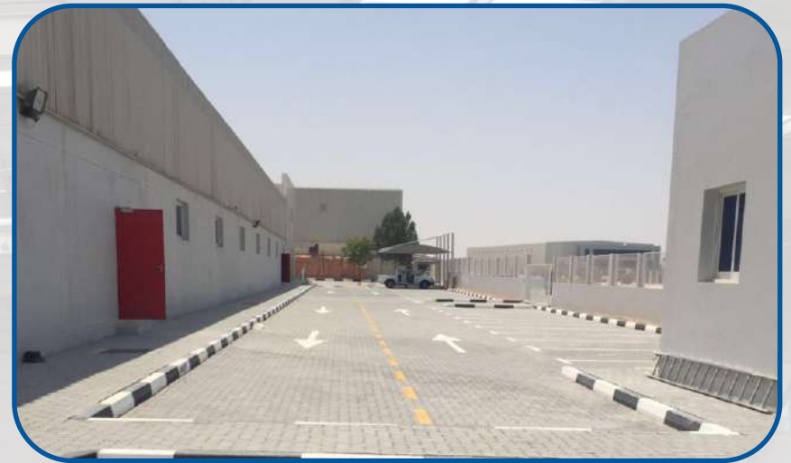
Warehouse + (G+M) Office Block JAFZA South, Jebel Ali, Dubai - UAE.