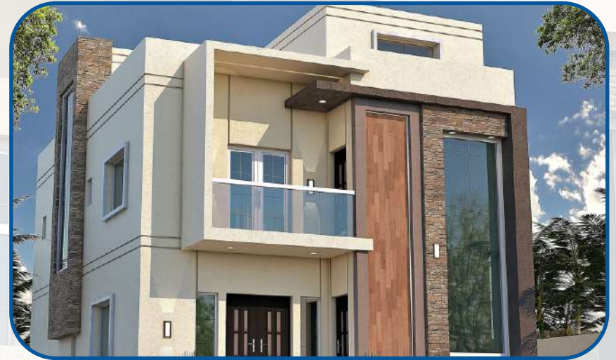
Ground+1 Villa Al Zahya, Ajman - UAE.