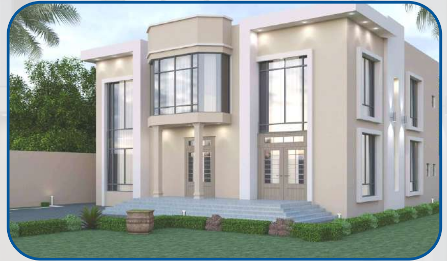
Ground+1 Villa + Garage + Boundary Wall Helio 1, Ajman - UAE.