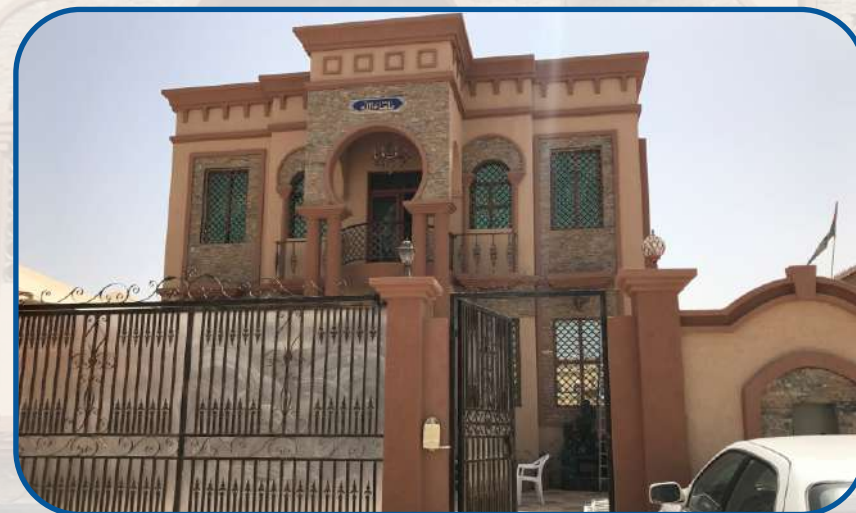
G+1 Residential Villa Al Rawdha 3, Ajman - UAE.