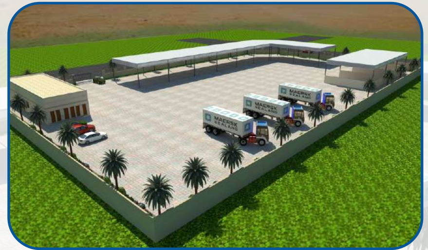
Open Sheds & Office Block Dubai Industrial City, Dubai - UAE.