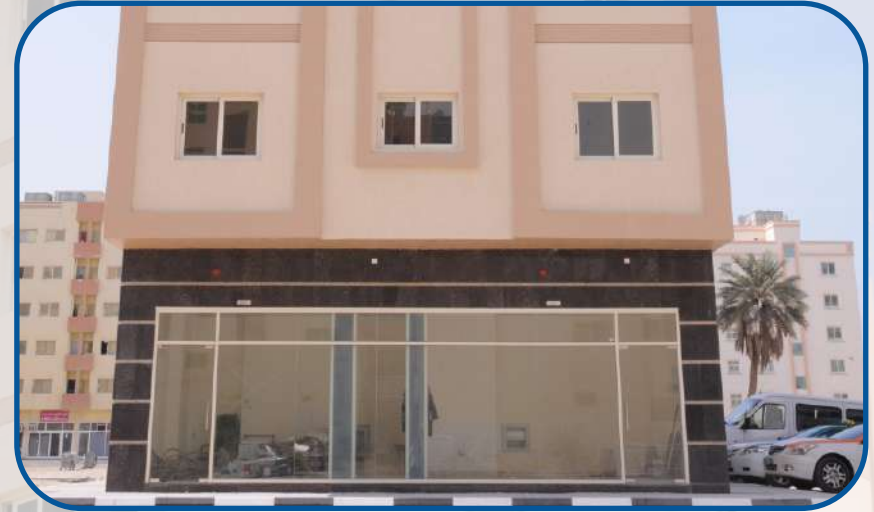
G+4 Commercial & Residential Building Al Qulayya, Sharjah - UAE.