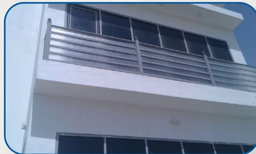
G+1 Residential Villa Al Barsha South 2, Dubai - UAE.