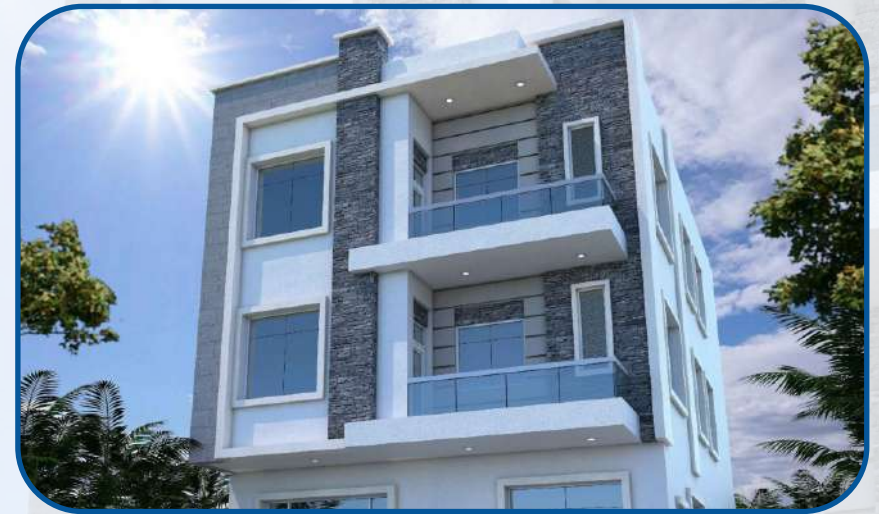
Ground+2 Villa + Roof + Boundary Wall Helio 2, Ajman - UAE.