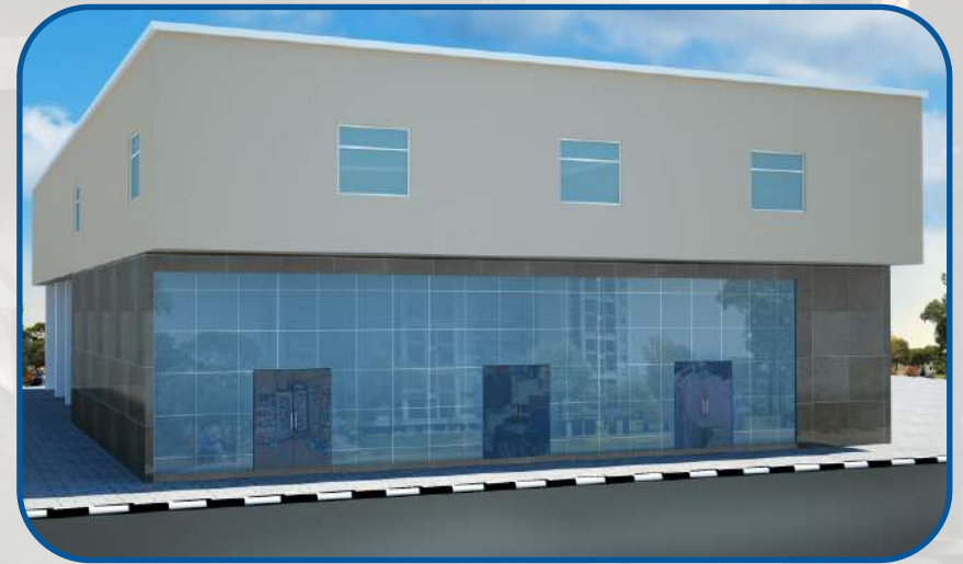
G+1 Commercial Building Al Jurf, Ajman - UAE.