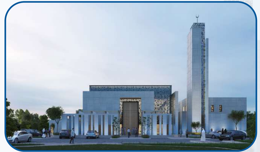
Juma Mosque + Service Block MBRAMC, District One, Dubai - UAE.