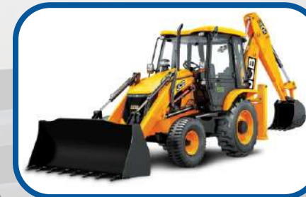
JCB 3CX Back Hoe Loader