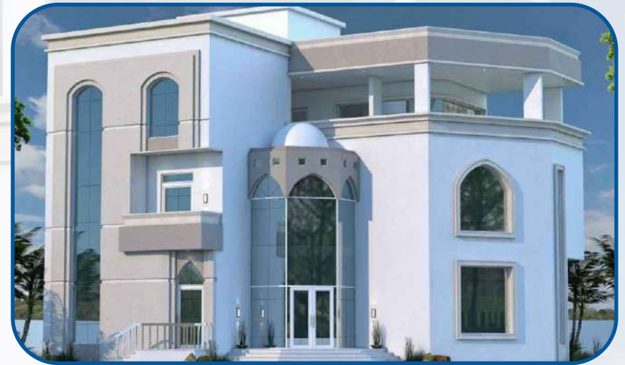
Ground+2 Villa + Garage + Boundary Wall Helio 2, Ajman - UAE.