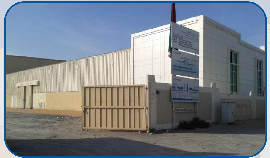
Perfume Production Factory Industrial Area 15, Sharjah - UAE.