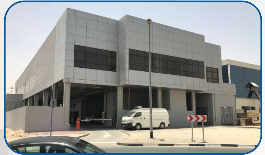
Commercial Office Building (G+M) Nad Al Hamar, Dubai - UAE.