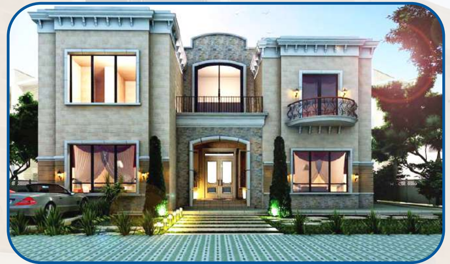
B+G+1 Residential Villa Al Qusais 3, Dubai - UAE.