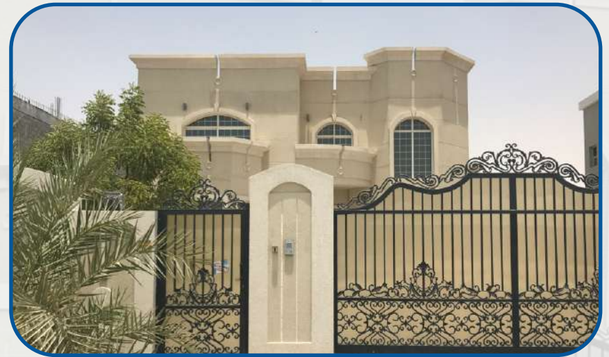
G+1 Residential Villa Al Barsha South 2, Dubai - UAE.