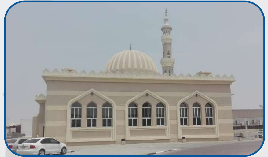
Masjid + Imam House + Service Block Industrial Area 11, Sharjah - UAE.