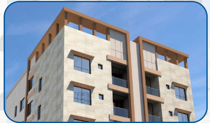
G+4 Commercial & Residential Building Al Ghuwair, Sharjah - UAE.