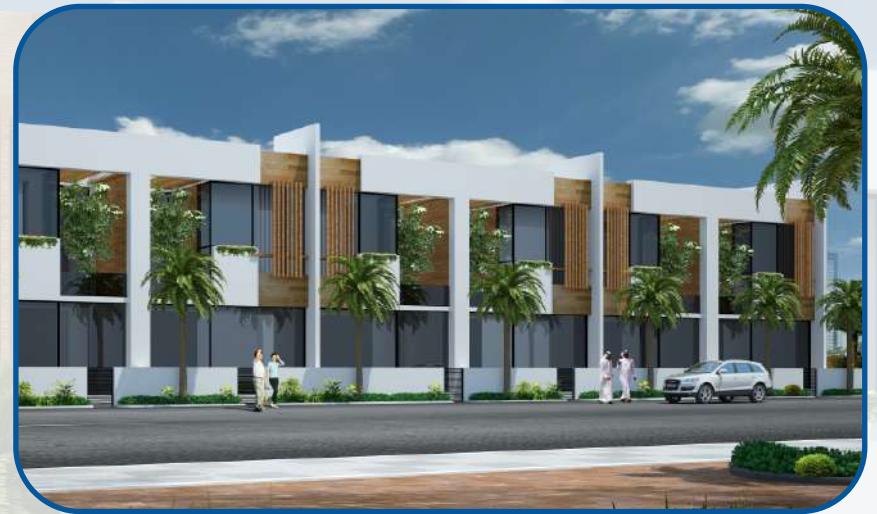
G+1+R Group of Residential Villa's (7 Nos) Al Furjan, Jebel Ali First, Dubai - UAE.