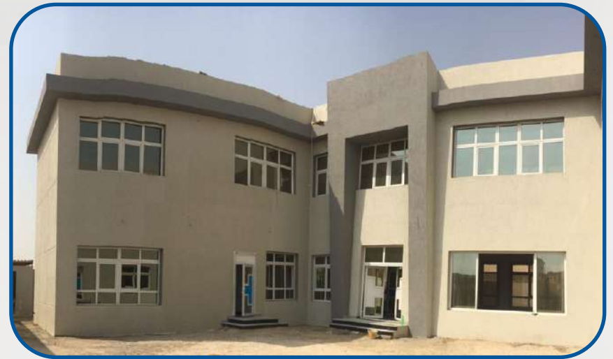
G+1 Residential Villa Al Khawaneej 2, Dubai - UAE.