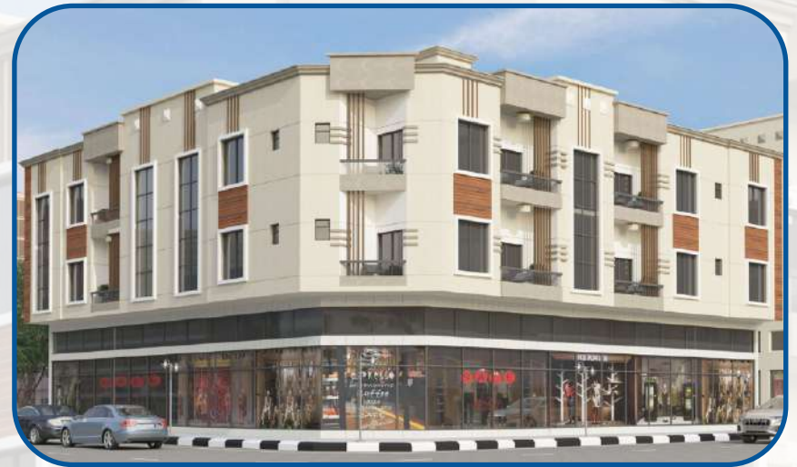
Ground+2 Building Al Rawdha 3, Ajman - UAE.