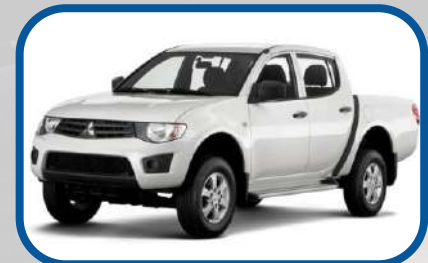
Pickups (1 & 2 Tons)