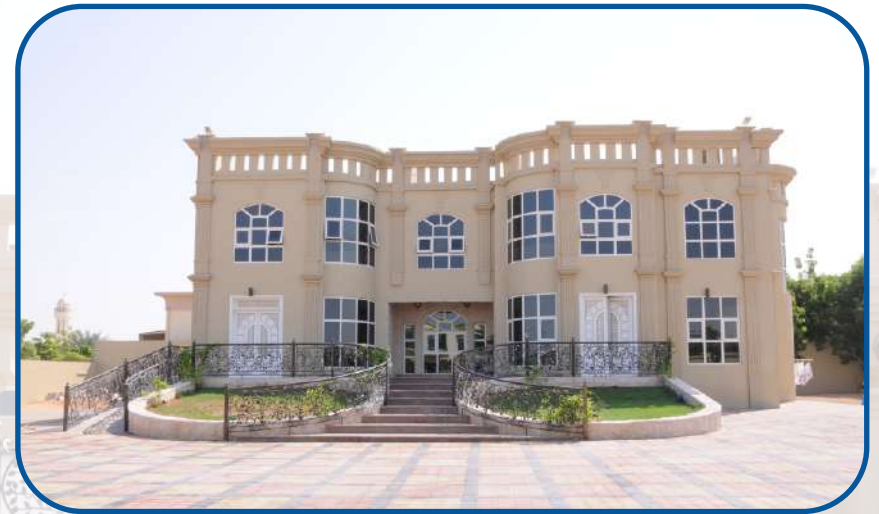
G+1 Residential Villa Al Jurf, Ajman - UAE.