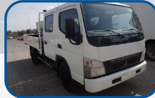
Pickups (3 & 4.5 Tons)