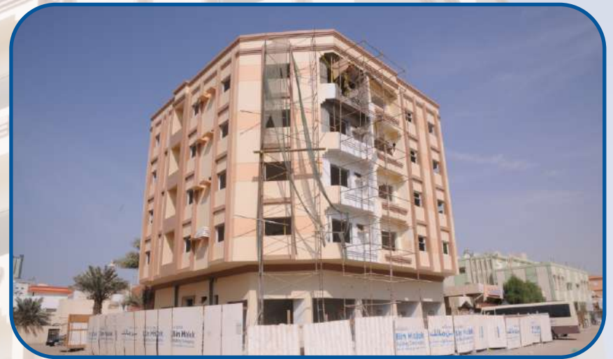
G+4 Commercial & Residential Building Al Nuaimayah, Ajman - UAE.