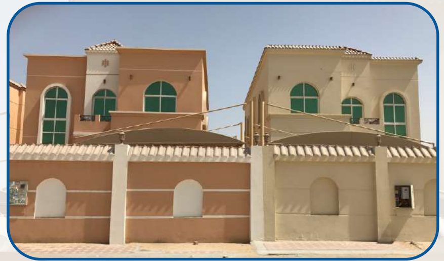
(2 Nos) G+1 Residential Villa Mohaiyath 1, Ajman - UAE.